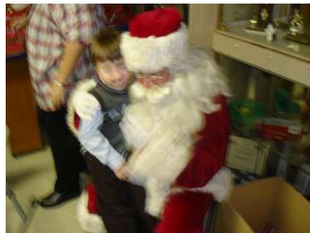
Santa listens to all the Wishes of our children