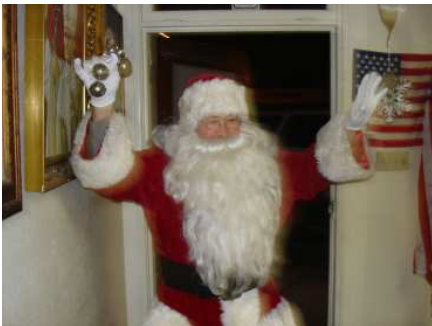
Ho Ho Ho The jolly elf is here